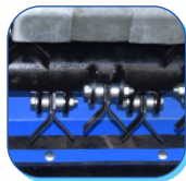
BORON STEEL Y BLADES