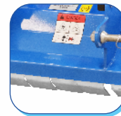
FRONT FLAP CURTAIN