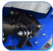
ANTI WRAPPING GUARD ON ROLLER & ROTOR