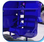
OPTIONAL OUTLET HELPS IN EASY FILLING OF GRAINS INTO BAG