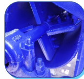
DOUBLE FAN SYSTEM ENSURES BETTER CLEANING OF CROP