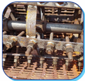
RUGGED CRUSHING BOLTS HELPS IN BETTER THRESHING