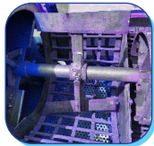
EFFICIENT SCRAPING SYSTEM ENSURES EASY REMOVAL OF OUTER SHEATH