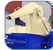
BELT ELEVATOR ENSURES EASY FEEDING INTO TROLLEY