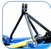
MOUNTED WITH 3 POINTS LINKAGE FOR EASE OF OPERATION