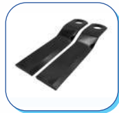
BORON STEEL HEAVY DUTY CUTTING BLADE