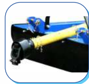
PTO SHAFT WITH SAFETY SHEAR BOLTS FOR EXTRA SAFETY