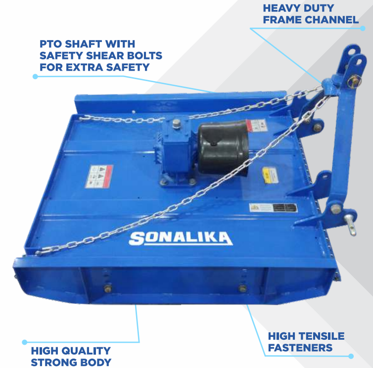
HEAVY DUTY FRAME CHANNEL